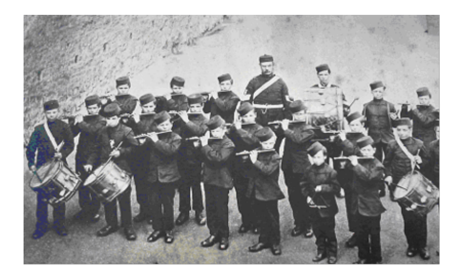
Note: The Bandmaster is now a Serjeant and the boys shoes are now clean, but wear no badges in their pillbox hats.