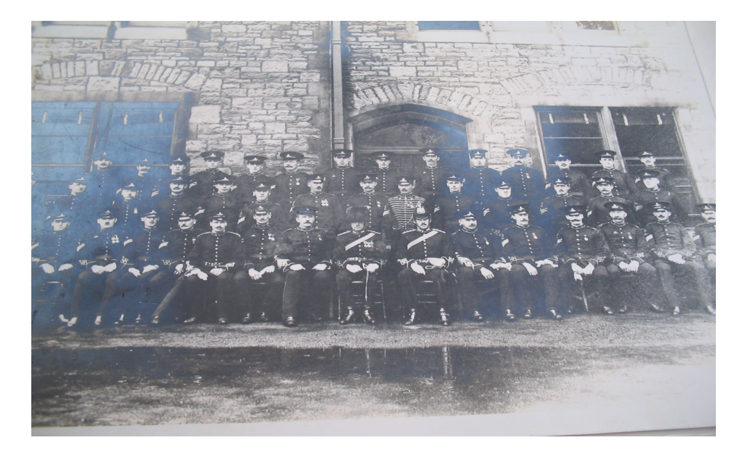
The Sgt's Mess with guest's the Colonel and Adjutant.

[Notice the two officers, one is wearing a Busby and the other one is wearing the police type helmet. The helmet [regulars only] did not come into use before 1902.]