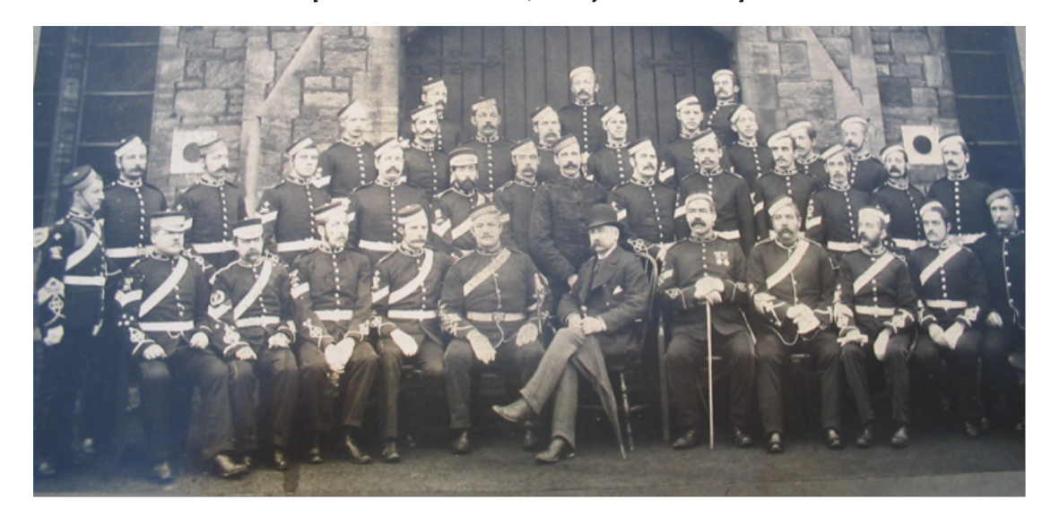
Note: The badges of rank worn by the front rank, also the handlebar moustaches and the beard of one man who wears the rank of Sgt, who along with two other men wears a peak hat,[front row assume to be regulars] the others wear a pillbox hat. The man directly behind the Colonel in the picture is wearing an officers dark blue uniform. The Adjutant perhaps?. He has four lines of cord? decoration on the front of his jacket, so he is a Captain.